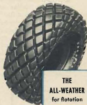
THE ALL-WEATHER for flotation

Sure-Grip, All-Weather—T.M.'s The Goodyear Tire & Rubber Company, Akron, Ohio